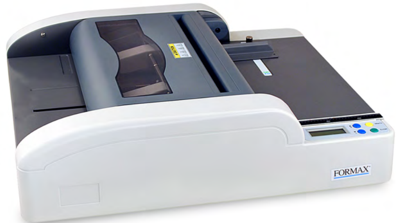
LCD Display and Push-Button Controls