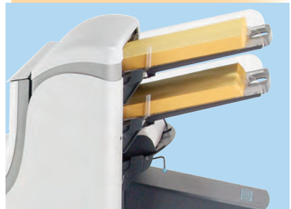
2 sheet feeders and 1 insert/BRE feeder