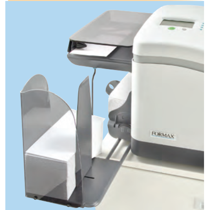
Side exit tray