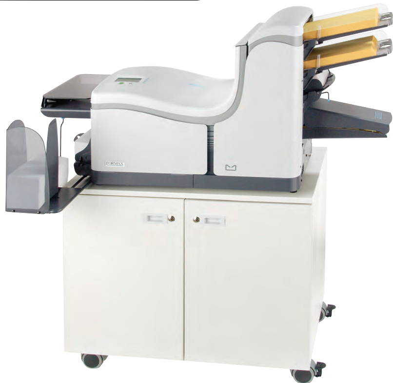
FD 6202-Advanced 2, shown with optional side exit tray and cabinet