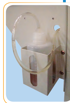
EvenFlow™ Oiling System Reservoir Bottle

Safety is an important component in the 8802 Series design and engineering. A large 18"-wide safety bar is located in front of the conveyor belt system and will shut down the shredder instantly when pressed. A safety key and lock system is also included to ensure the shredder is operated only by authorized staff.