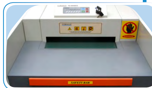
Large infeed deck with conveyor belt feeder and safety bar for immediate shut down

Keeping the 8802 Series in top condition is easy to do. With the Auto Cleaning function, clearing the blades of shredding debris is as simple as pressing Reverse on the control panel. Plus, the EvenFlow™ Automatic Oiling System lubricates the all-steel cutting blades, helping to keep the shredder in peak condition for optimal efficiency.