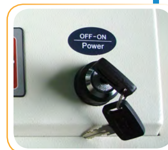
Keyed On/Off switch

The 8802 Series offers unmatched automated features through its LED control panel. The easy-to-read Load Indicator assists operators in determining how close they are to the maximum shred capacity to avoid jams and provide optimal efficiency. Indicators also notify operators when the waste bin is full or the cabinet door is open. Operators can select from two modes of operation: Auto Start/Stop or Manual. Auto Start/Stop mode utilizes optical sensors which detect paper and start/stop operation automatically. Manual mode provides non-stop operation for shredding small sized paper or films.