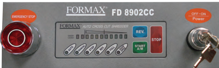
LED control panel with visual load indicator and safety key lock

The FD 8902B offers unmatched automated features through its LED control panel. The easy-to-read Load Indicator assists operators in determining how close they are to the maximum shred capacity to avoid jams and provide optimal efficiency. Operators can select from two modes of operation: Auto Start/Stop or Manual. Auto Start/Stop mode utilizes optical sensors which detect paper and start/stop operation automatically. Manual mode provides non-stop operation for shredding small sized paper or films. The Safety Key Lock prevents unauthorized use of the shredder.