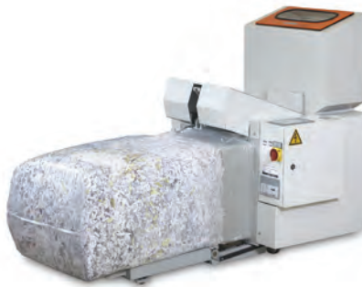
FD 8902B with full bale

The FD 8902B features a powerful high-capacity Output Baler which continually compacts shredded material into a bale, which improves throughput capacity by minimizing the frequency of unloading the shredder. Sensors automatically stop the shredding mechanism when the baler is full. The FD 8902B is the ultimate solution for high-capacity centralized shredding.