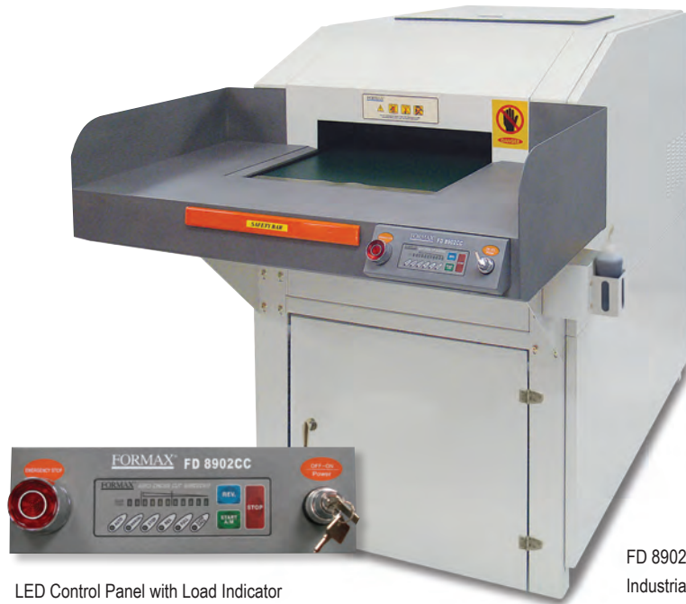
LED Control Panel with Load Indicator