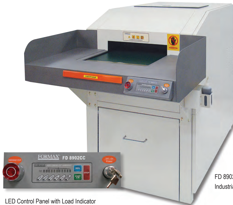
LED Control Panel with Load Indicator