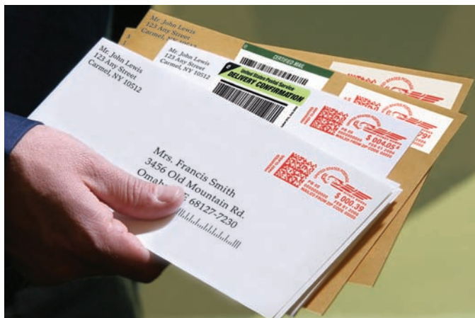
Full range of carrier rates and services right from your mail center.