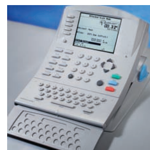
The control center offers ease of use and access to services.