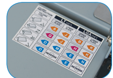
Clearly marked fold guide for quick and easy setup

The FD 300 Office Desktop Folder provides an economical solution for low-volume folding projects. This compact folder processes 11" and 14" paper at speeds up to 7,400 sheets per hour, and is clearly marked for 4 common fold settings.