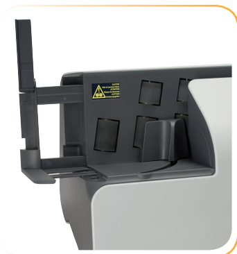
Easy-to-use support arm extends to hold large envelopes